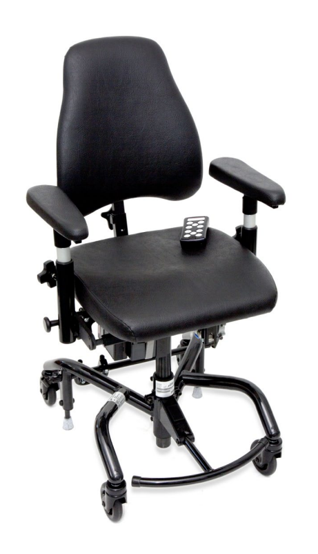
The chair in the photo is fitted with PLUS-base clinic 43x53cm]