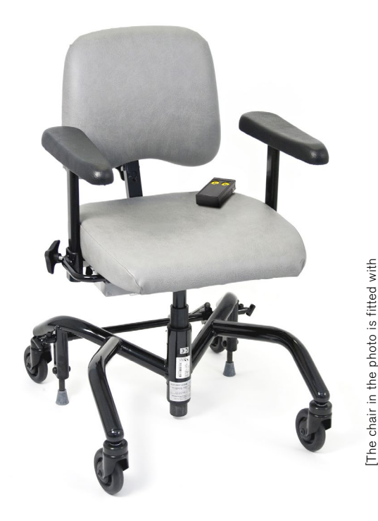
PLUS-base clinic 48x53cm]