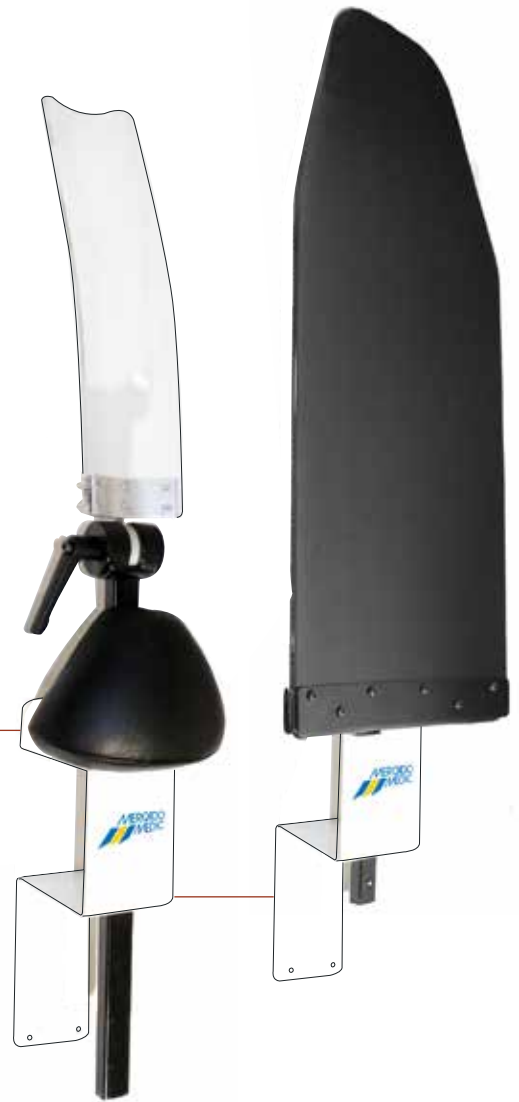
Wall mounts for backrests that is not mounted on the chair.