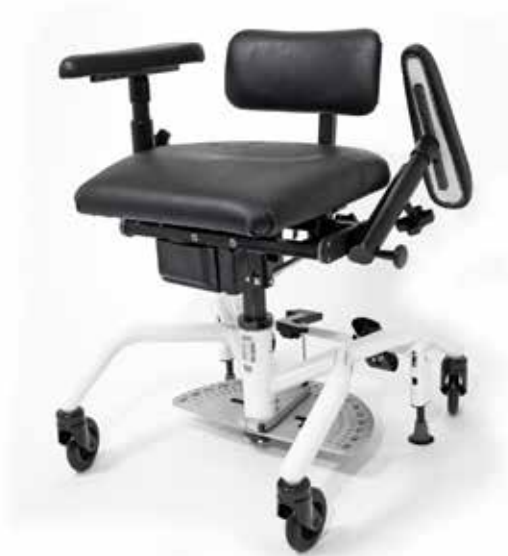
Low backrest 33x16 cm (standard).