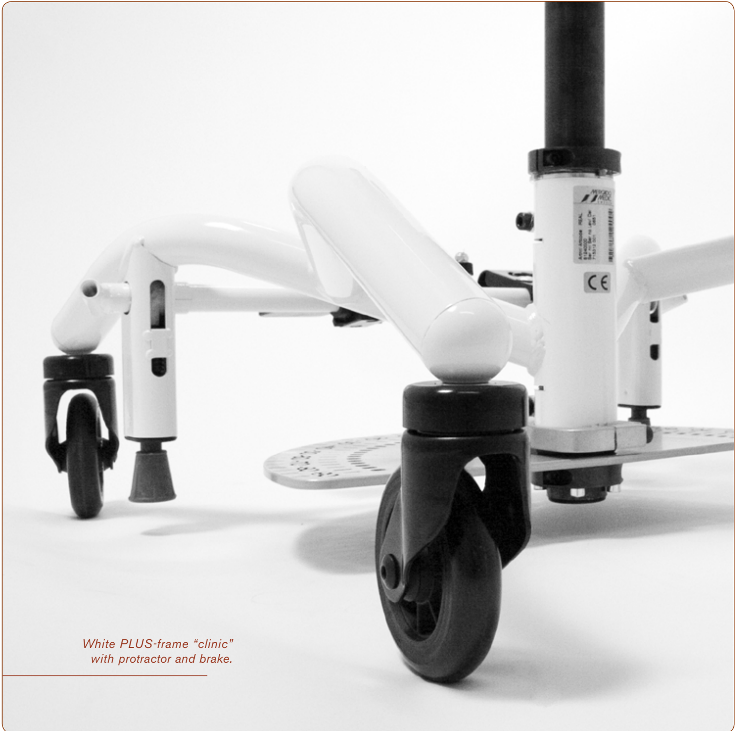
White PLUS-frame "clinic" with protractor and brake.