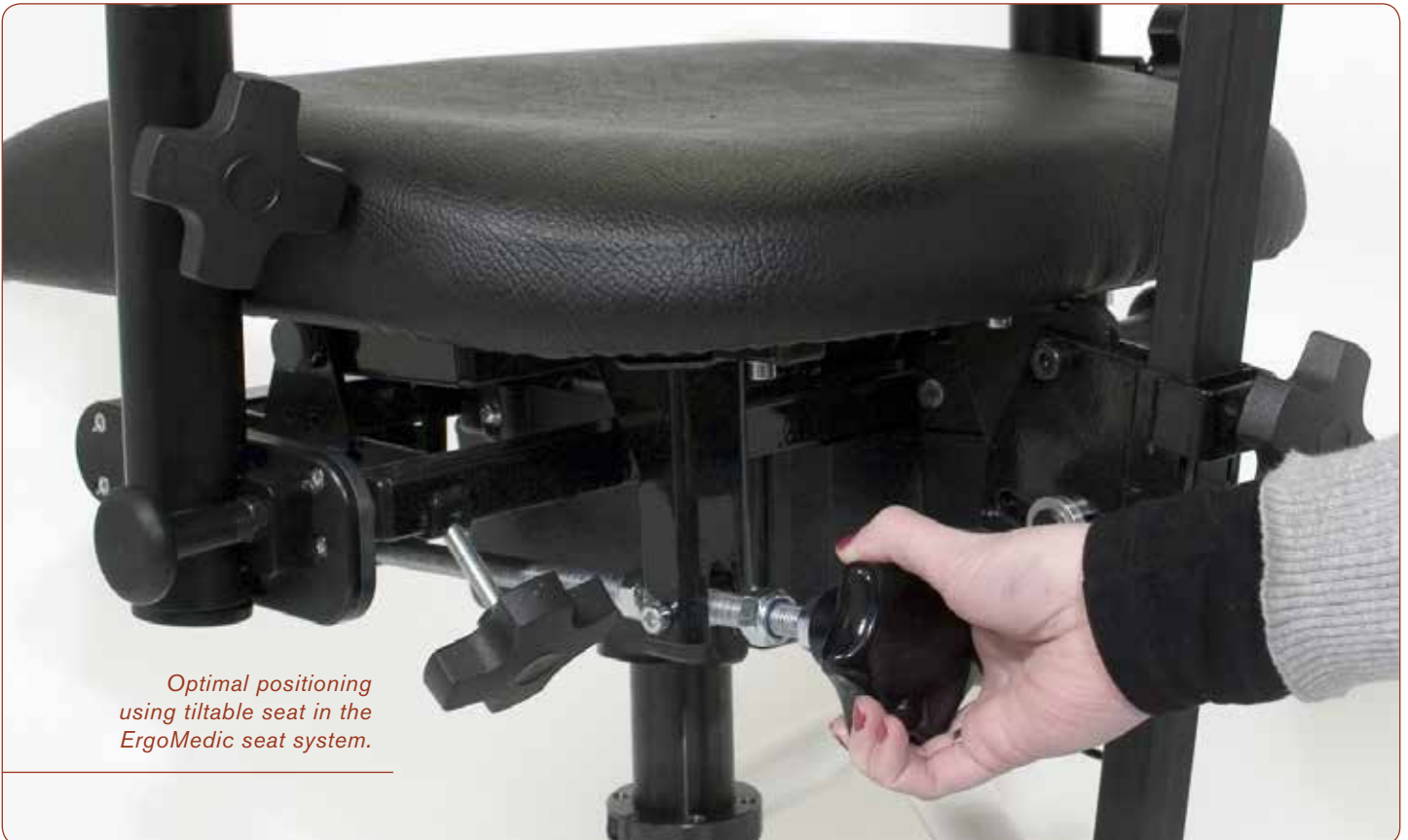
Optimal positioning using tiltable seat in the ErgoMedic seat system.

The adjustable seat angle, forwards and backwards, makes it easy to find the correct position for the patient.