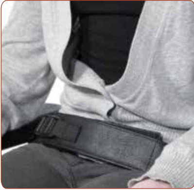
Positioning / hip belt.