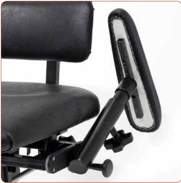
Foldable armrest for easier lateral movements.