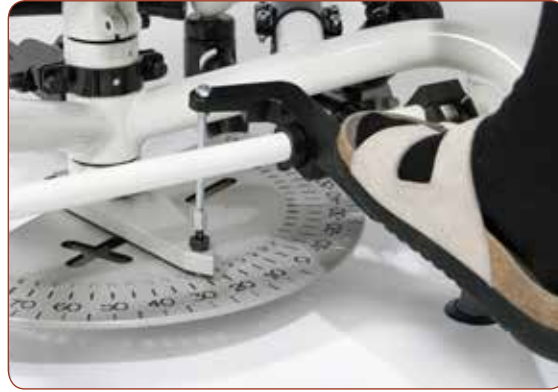
Protractor and brake are controlled by foot.