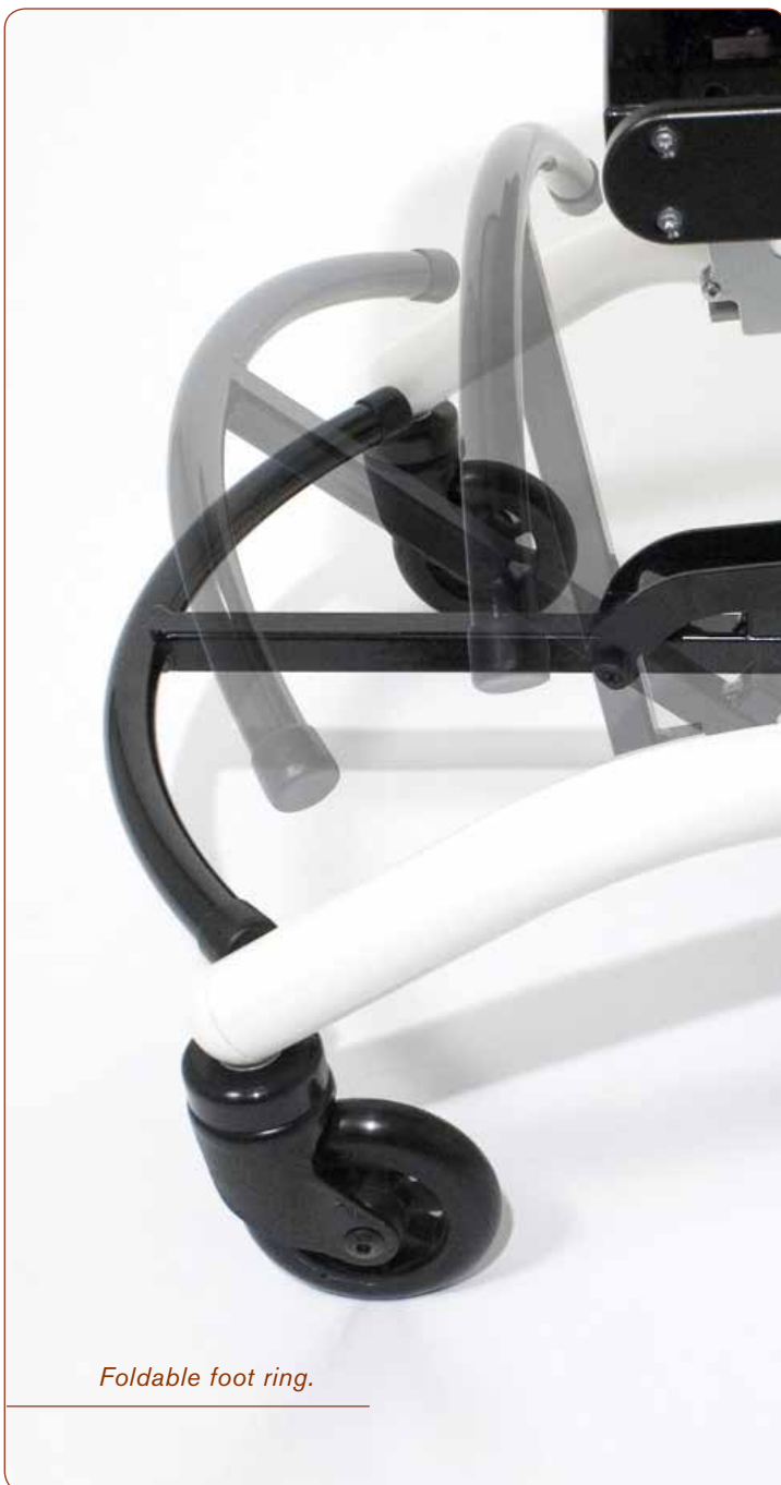
Foldable foot ring.

As accessories, we have wall mounts for the backrests that is not mounted on the chair.