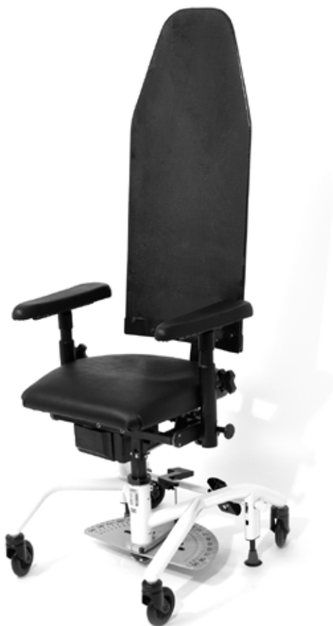
Backrest with neck support in Makrolon (standard).