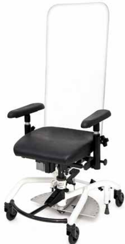
High, transparent backrest (optional) - NEW!