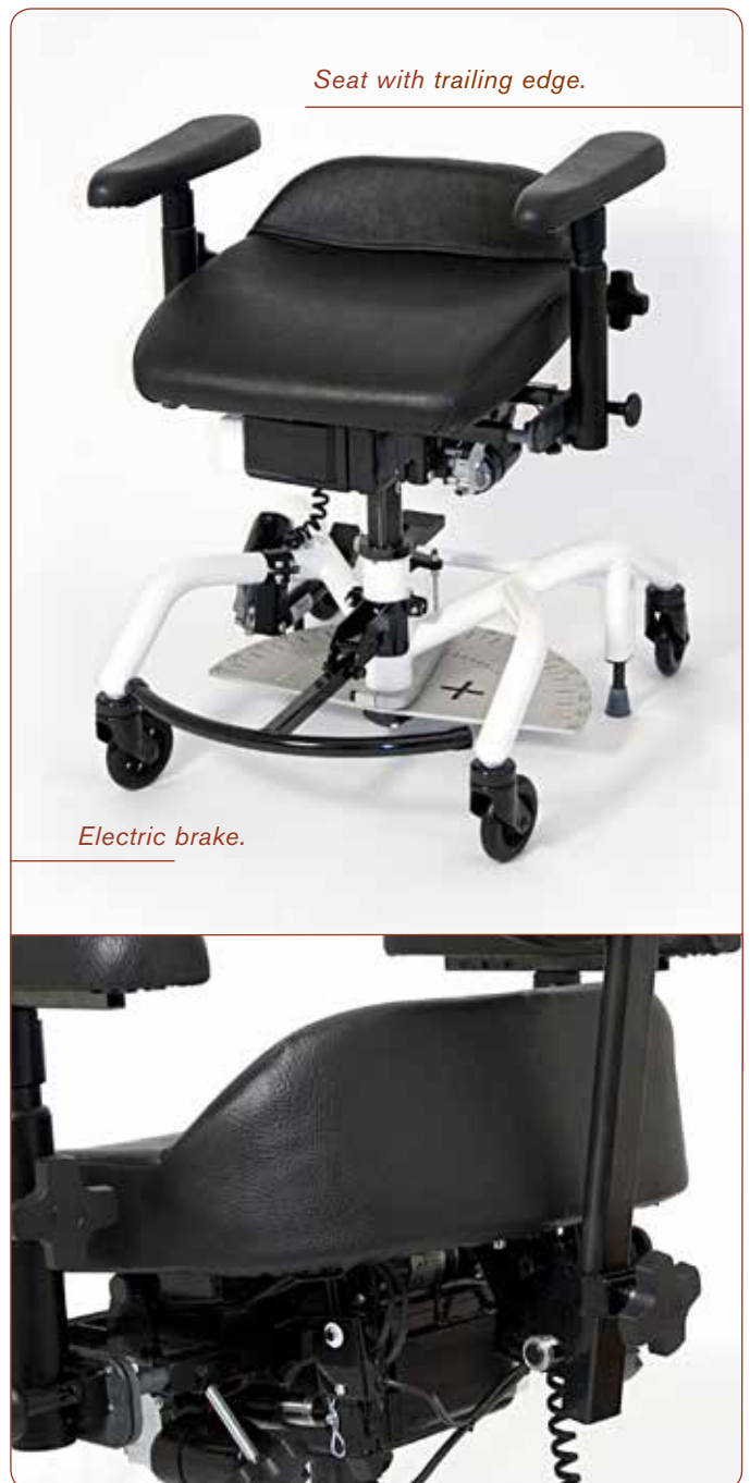
Seat with trailing edge.