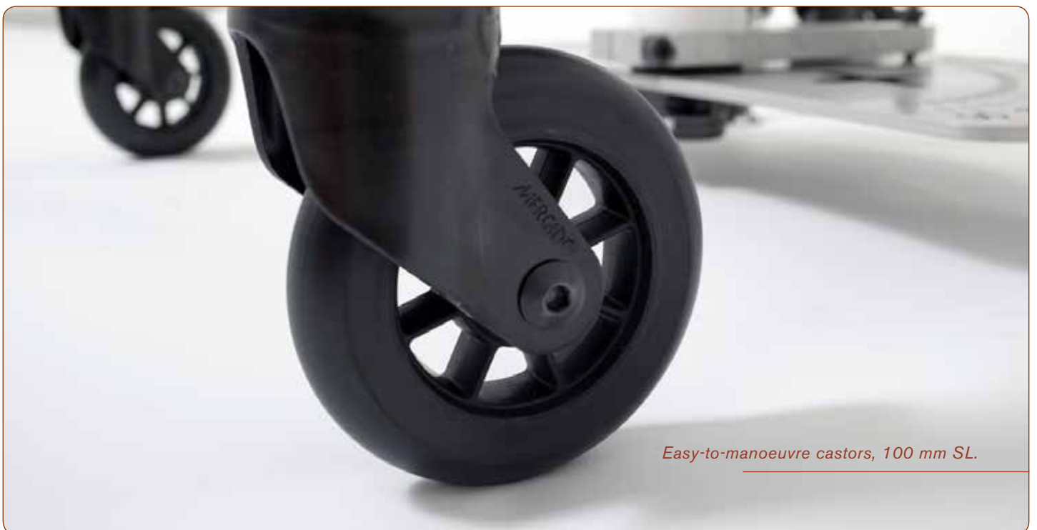
Easy-to-maneuvre castors, 100 mm SL.