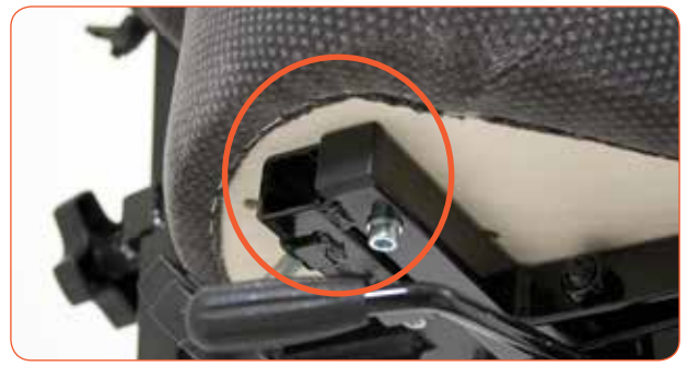
[ Prepared for armrest. ]

To perform jobs by the kitchen sink or the ironing board are examples on two tasks that require a stand up working posture. Both of which take a long time to fulfill and tiredness in legs and back can become very disturbing. In cases like this a