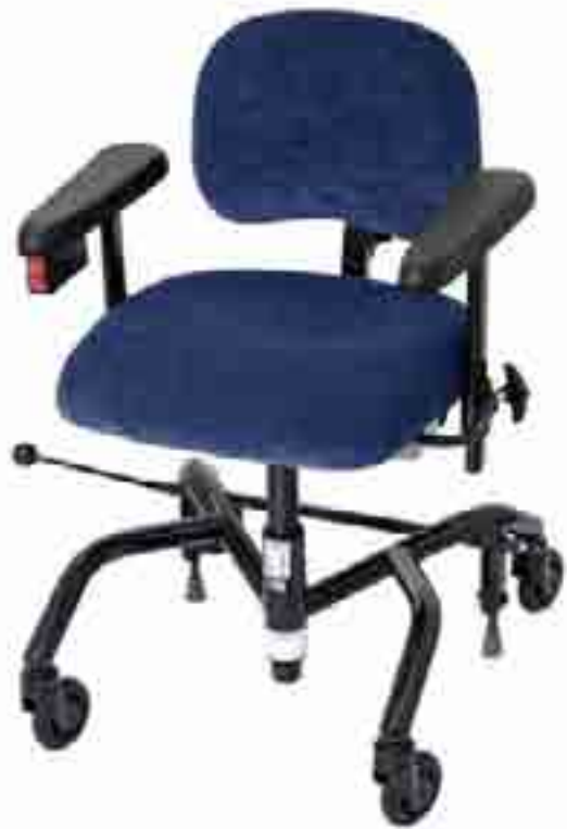
REAL 9100 PLUS EL