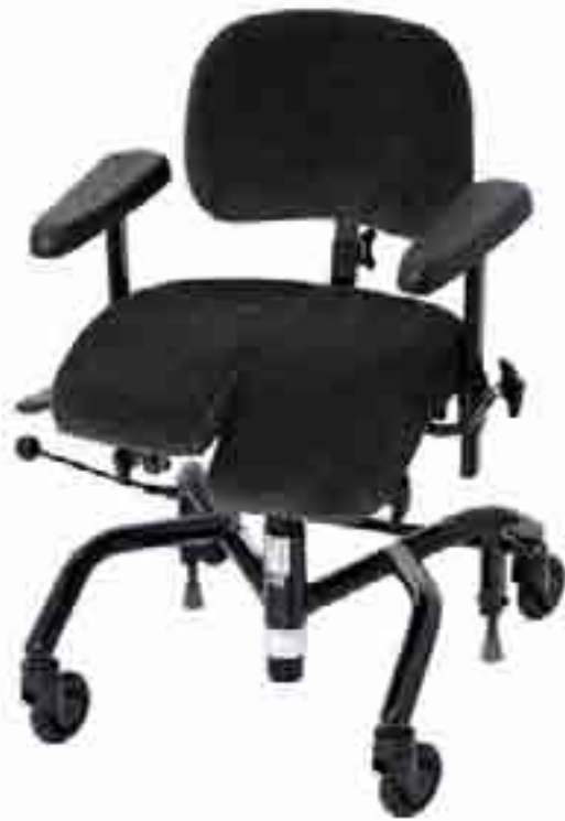
REAL 9700 PLUS COXIT