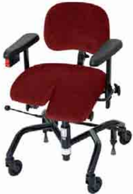
REAL 9800 PLUS COXIT EL