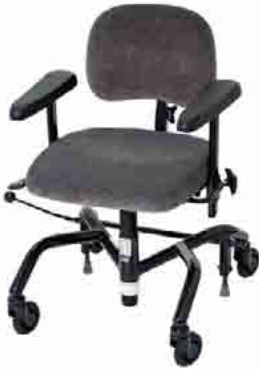
REAL 9000 PLUS